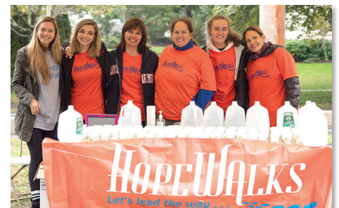
Volunteers from the Wellesley Chapter of the National Charity League