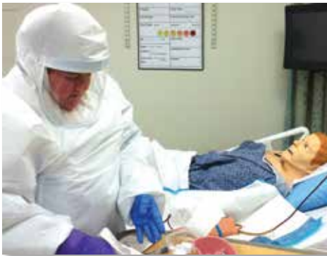
A nurse practices drawing blood from a suspected Ebola "patient" while wearing personal protective equipment.