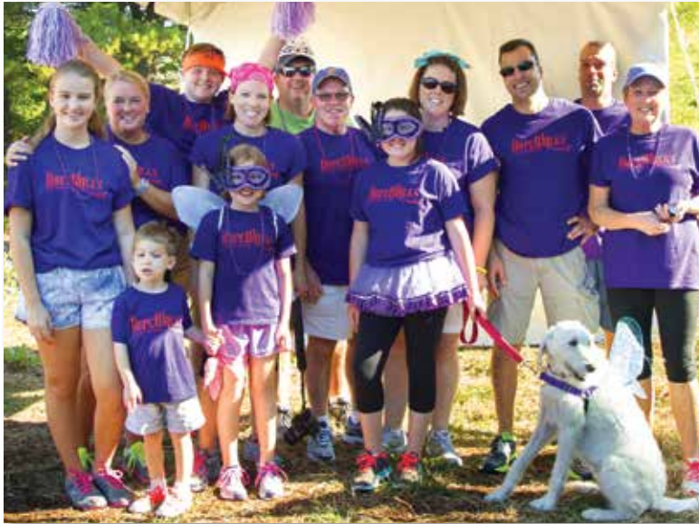
Caterina's Angels pose before setting off on the walk