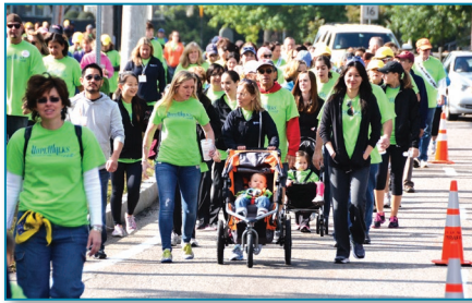
Walkers streamed up Commonwealth Avenue

Event Raises $180,000 for Cancer Patients and Their Families