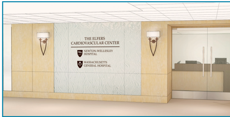
Architect's rendering of the Center's entrance