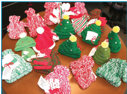
A sampling of adorable caps and booties knitted by the Dover Ladies Knitting Committee for babies born over the holidays