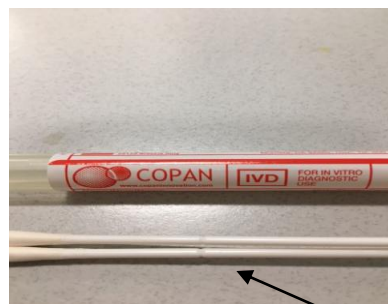
COPAN swab shafts are scored